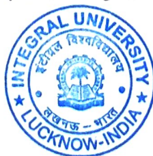
Director Admissions & Academics